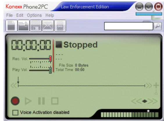
Phone 2 PC – Law Enforcement Software