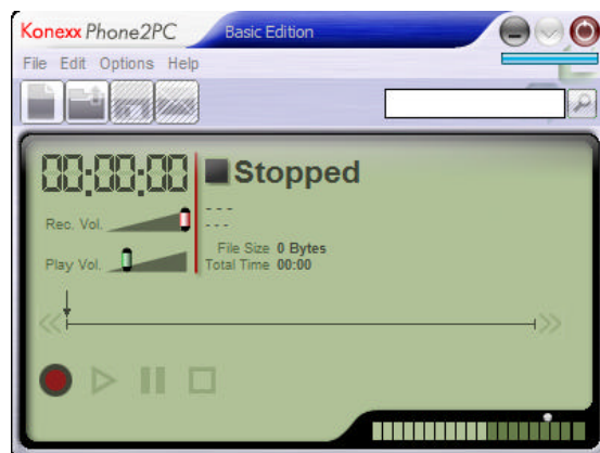
Phone 2 PC – Basic Software