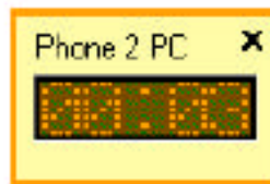
Screen Pop Counter for Convenient Position Reference