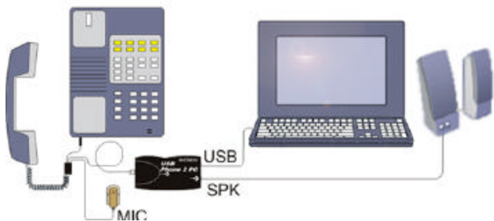
Phone 2 PC Interface