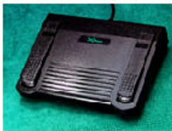
3 Key Foot Pedal