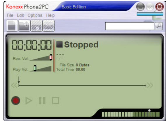
Phone 2 PC – Basic Software