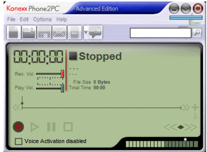
Phone 2 PC – Advanced Software